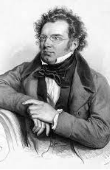
Franz Schubert Symphony No. 8 in B minor, D. 759 "Unfinished"