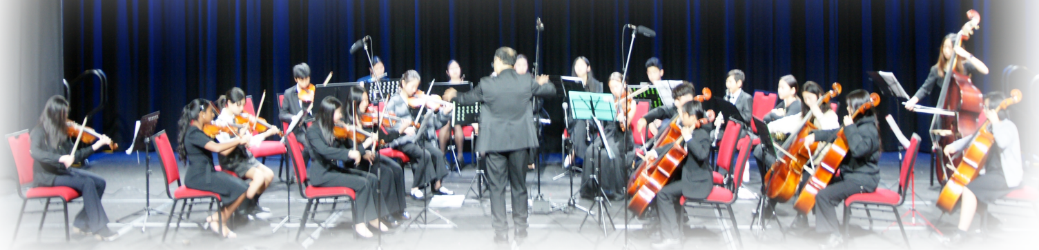
The Sydney Hills Youth Orchestra