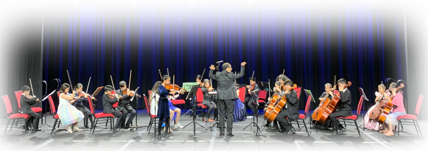
The Sydney Hills Junior Orchestra