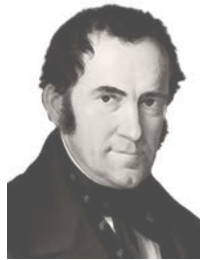
Franz Xaver Gruber

Tonight it is a simplified version specially arranged for the Junior Orchestra.